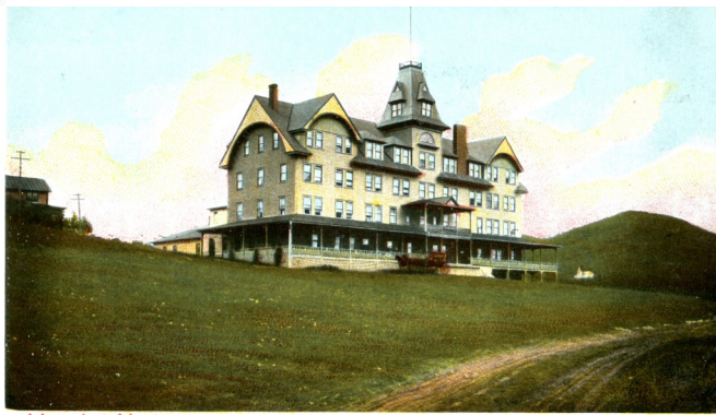
Adirondack Mountains, Lake Placid Inn.

We are pleased to announce that we are in the middle of a 2-year project to install a permanent "Lake Placid History" exhibit at the Museum. The first half of the exhibit titled, "Lake Placid: The Early Years," will document history from the 1800s to 1920. The opening reception will be held on June 16th, 5-7pm ($20 donation).