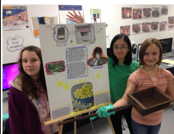
Students displaying finished projects to one another for feedback and comment

Finished projects will be displayed on a rotating basis at the museum during the 2015 season.